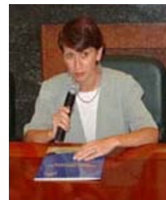
Pilar Mazzetti Soler

To back up this statement, an analysis published in the Ministry's Web page by Peru 's Health Minister Pilar Mazzetti Soler in the Ministry's Web page last August is cited. This document makes reference to the negative impacts of the FTA regarding access to medication, and it reports how such negotiations “inappropriately” include joining sanitary/health records with patents.